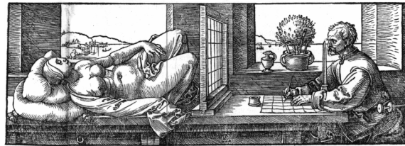
Figure 3. Albrecht Dürer, Draughtsman Drawing a Nude , 1538.

A well-known sixteenth-century woodcut illustration by Dürer (made for his how-to book on the mathematical practice of art) shows a male artist looking through such a grid at a seminude female model reclining before him (fig. 3). The text accompanying this illustration describes the