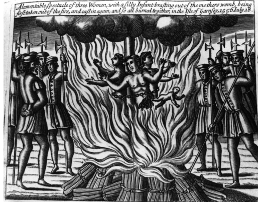
The Guernsey Martyrs, from John Foxe, Acts and Monuments (1684 ed.).